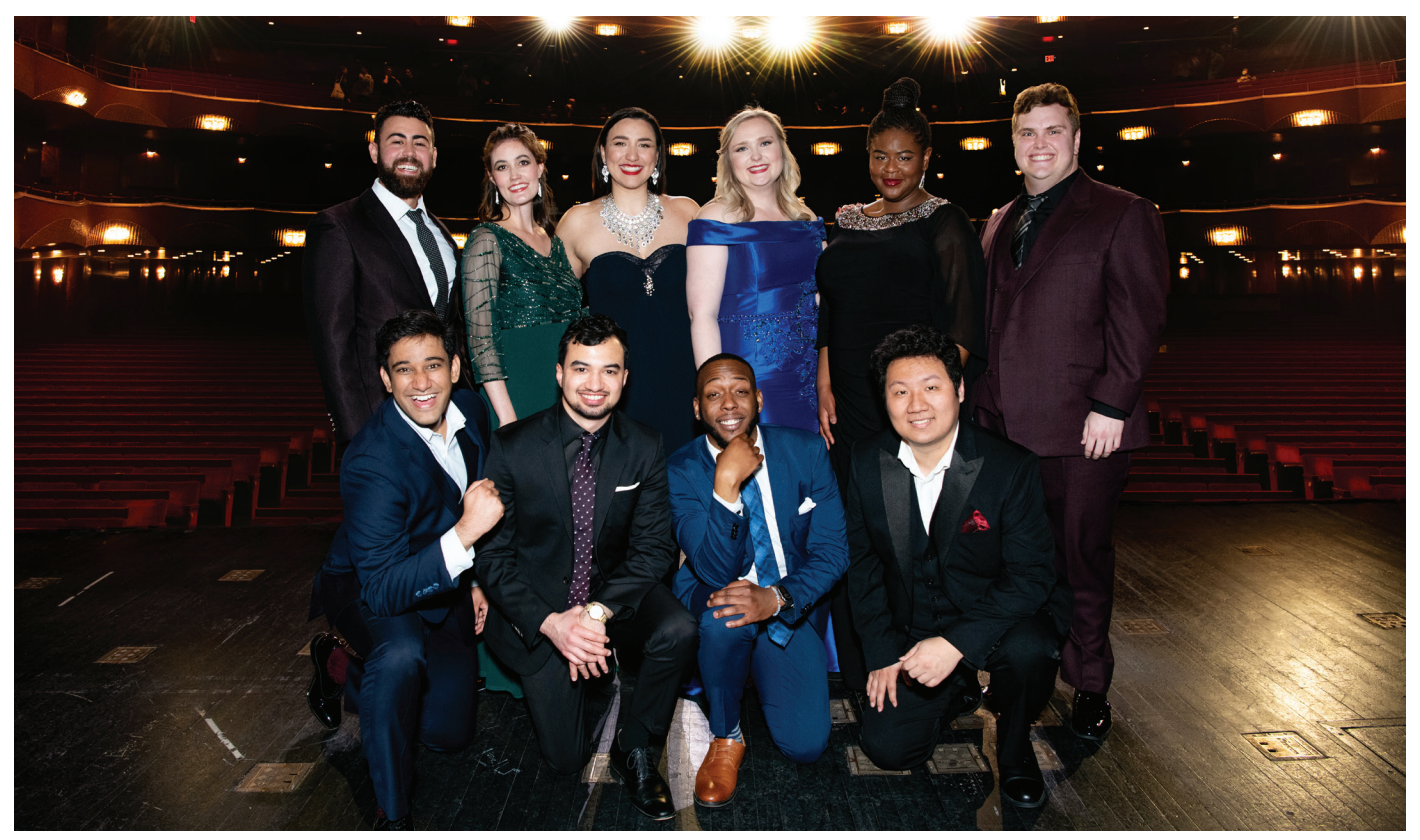
The 2023 Laffont Grand Finalists